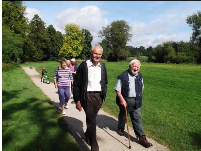
Forum members on a site visit to the Carrs park in Wilmslow