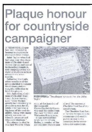
Crewe Chronicle 16 th October 2013

Against this aim, the Forum has secured publicity through local newspapers on a number of topics. This success has been of interest to the North West Regional LAF Chairs and resulted in an invitation to lead a workshop at the Northern LAF conference in 2014.